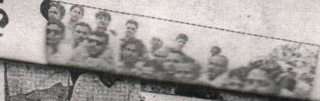
भाजपा की जीत पर